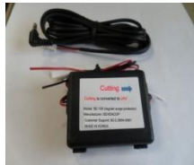
Power safety device