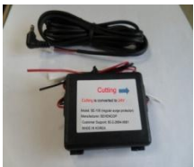
Power safety device