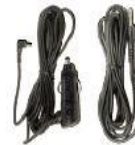
Power supply, AV cable