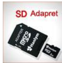
Micro SD CARD